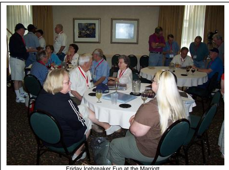
Friday Icebreaker Fun at the Marriott