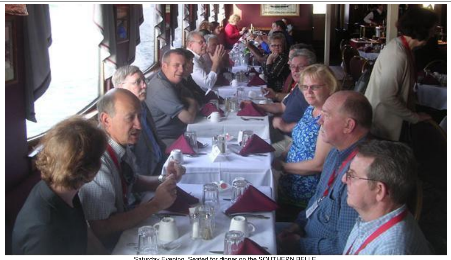
Saturday Evening. Seated for dinner on the SOUTHERN BELLE.