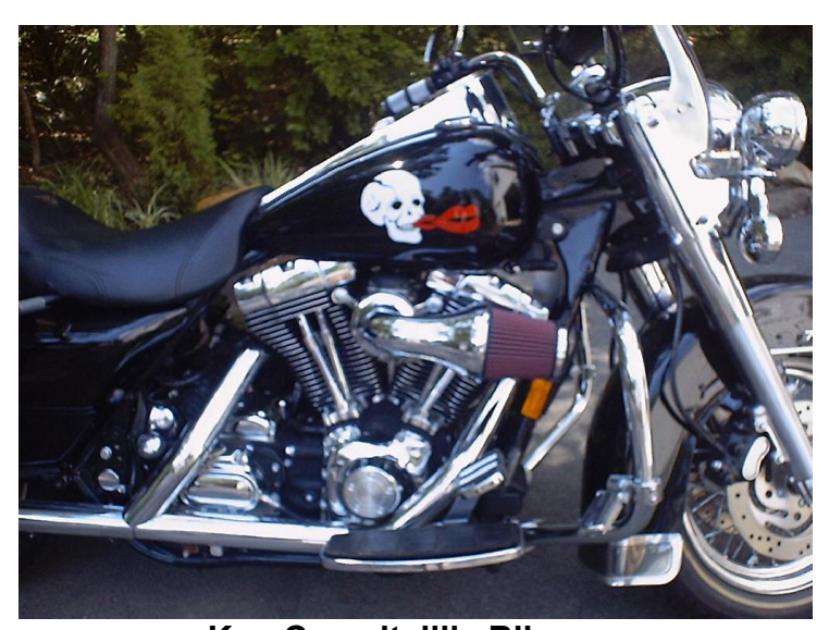
Ken Campitelli's Bike