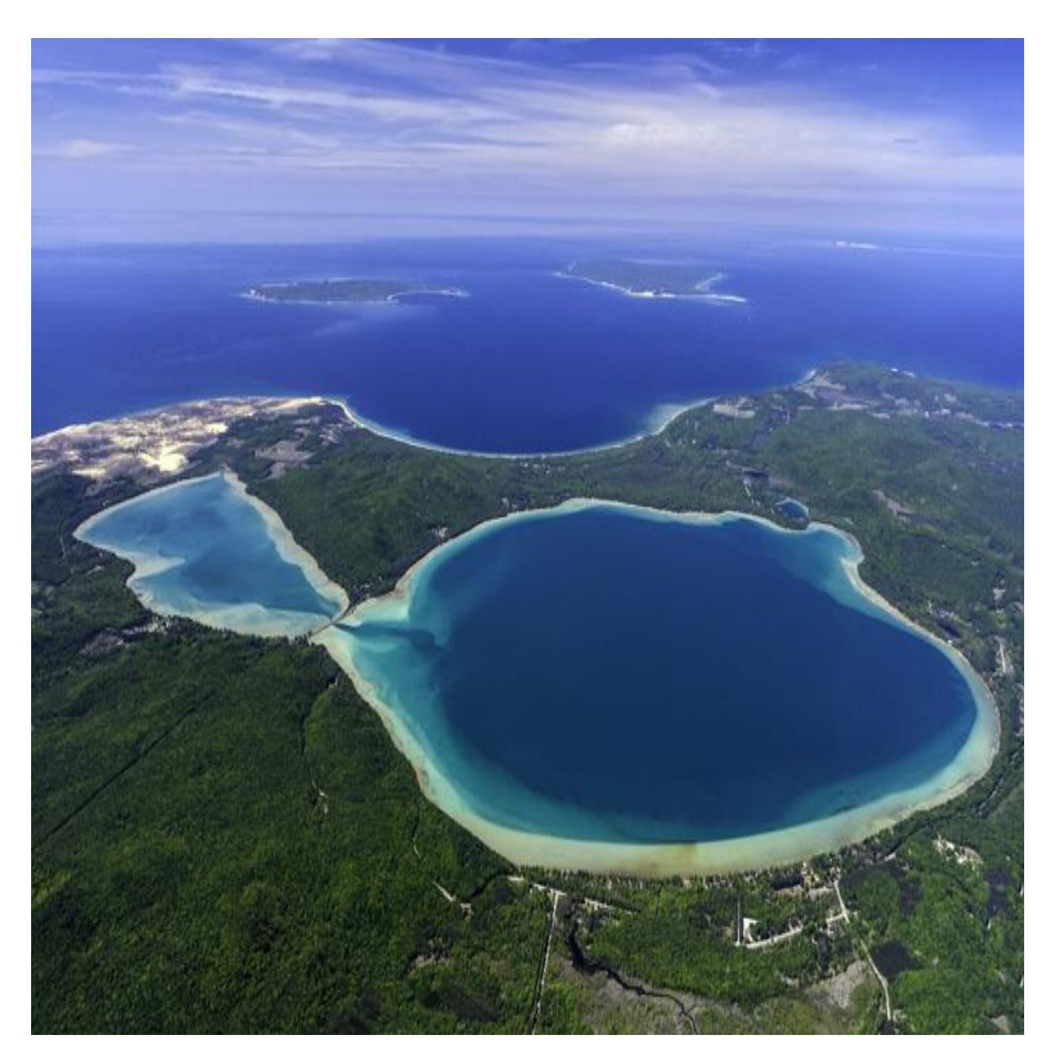
Big Glen Lake, voted the Most Beautiful Lake in America in 2011 by "Good Morning America". To it's left is Little Glen Lake, and behind that to the left is Sleeping Bear Dunes, then Lake Michigan and in the distance are the Manitou Islands. The Glen Lake Community is 21 miles northeast of Traverse City an easy day trip.