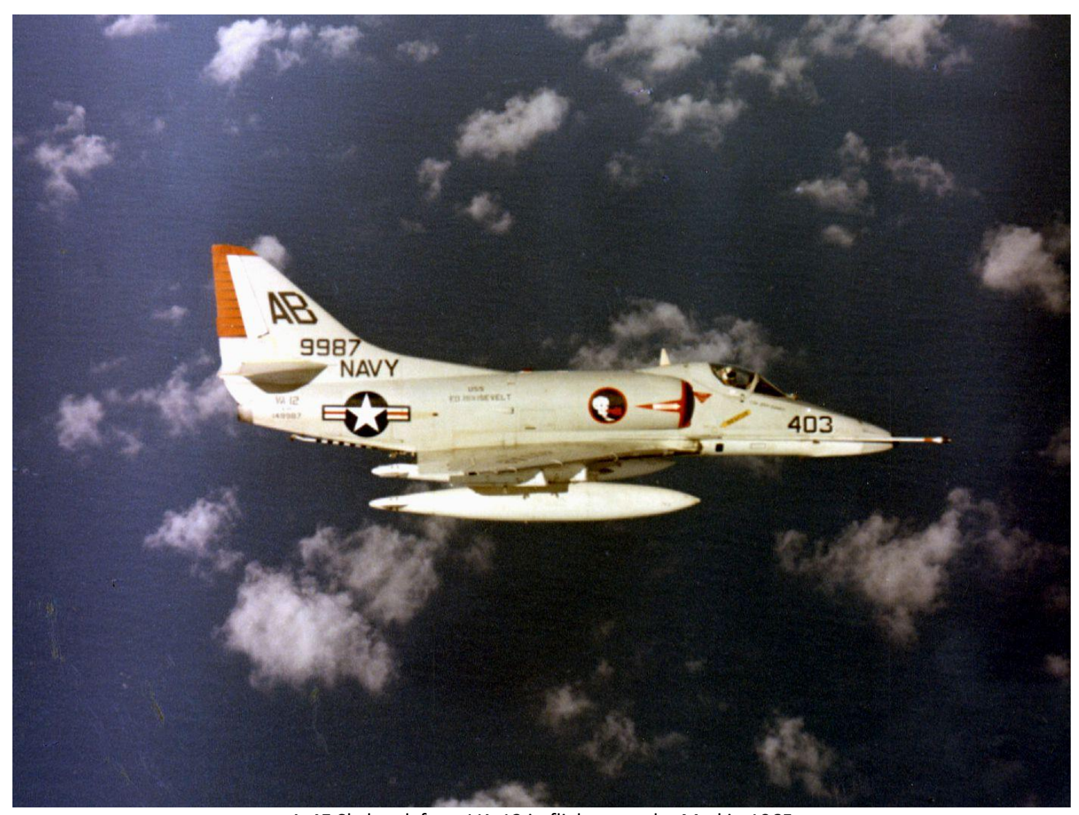
A-4E Skyhawk from VA-12 in flight over the Med in 1965