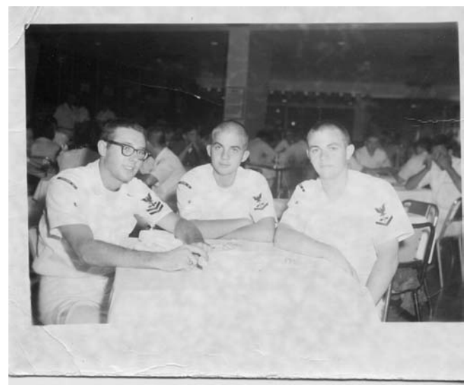
Subic Bay Liberty, 1966.