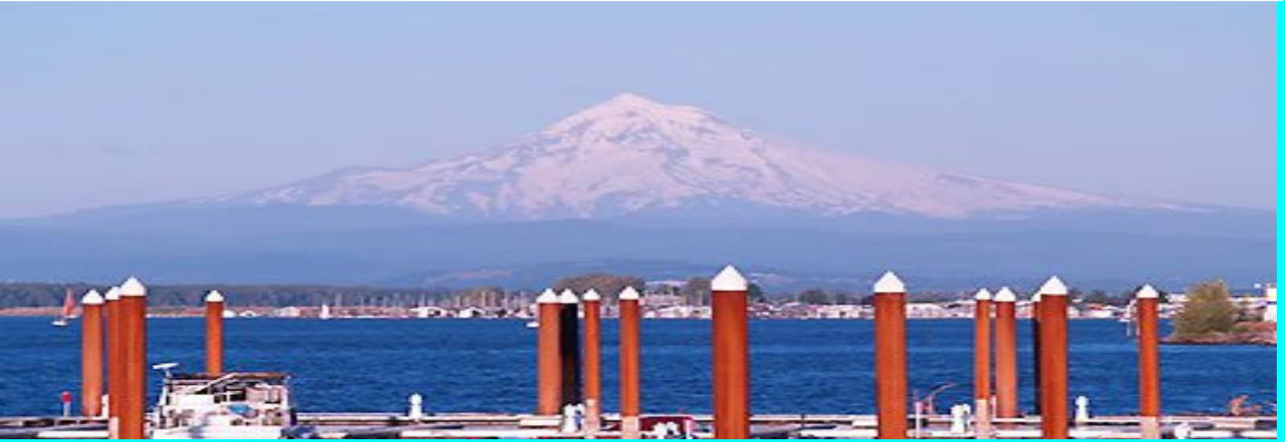
Mt. Hood, Oregon from the Red Lion river dock