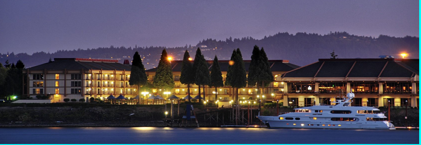
Red Lion On the River, Jantzen Beach – View from the Columbia River