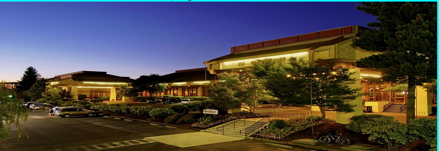
Red Lion On the River, Jantzen Beach – Main Entrance