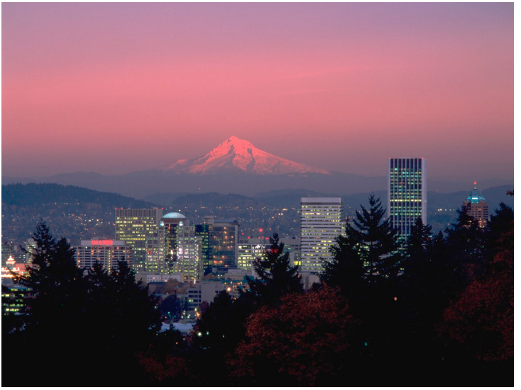
The view of Mt. Hood from downtown Portland

The National Historic Landmark "Timberline Lodge" is sited at the 6.000 foot level.