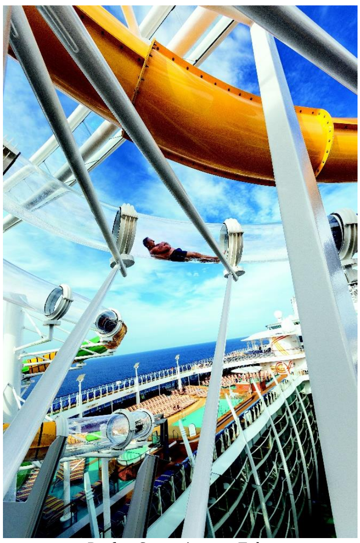
Perfect Storm Activity Tube