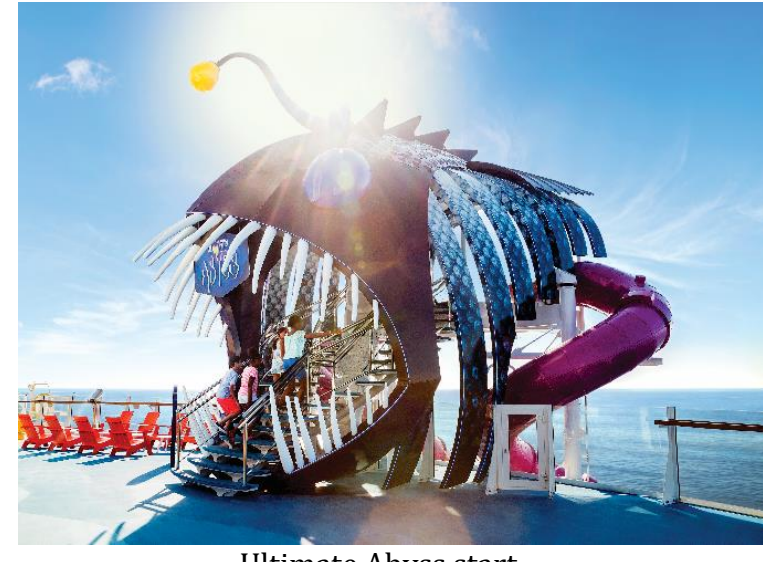
Ultimate Abyss start