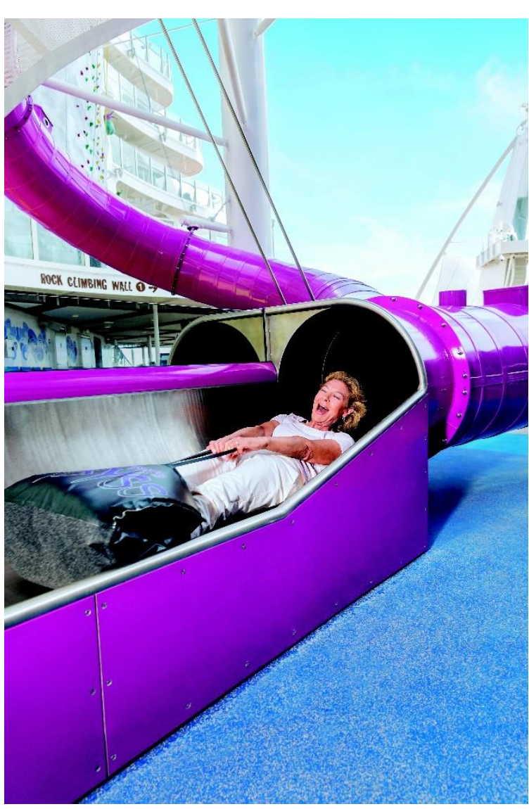
Ultimate Abyss Finish