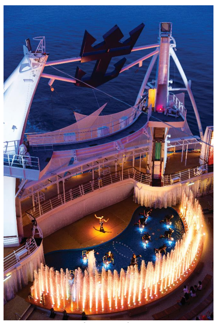
Aqua Theater Performance