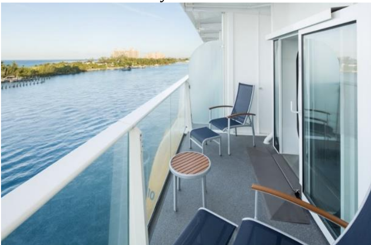
Balcony Cabin Outside