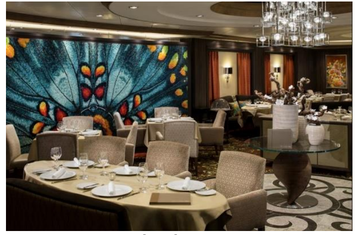
Central Park Restaurant