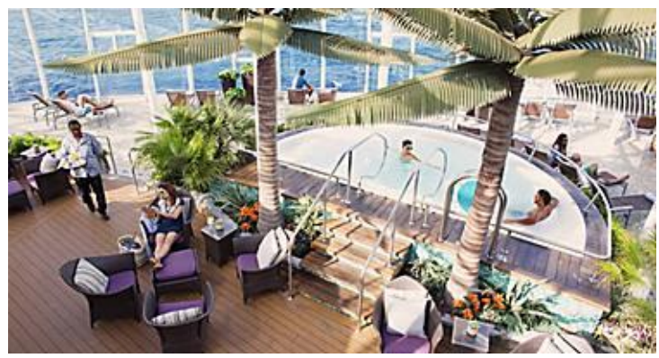
SOLARIUM SUN AND SERENITY

Slip away to this adults-only indoor and outdoor retreat. The Solarium is your slice of paradise, with soothing whirlpools, warm sunshine and a refreshing water mist.