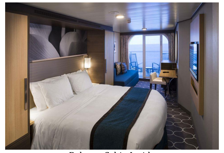
Balcony Cabin Inside

The following photos are of our Cruise ship, plus ports where we will stop and some things we can do while aboard or in port.