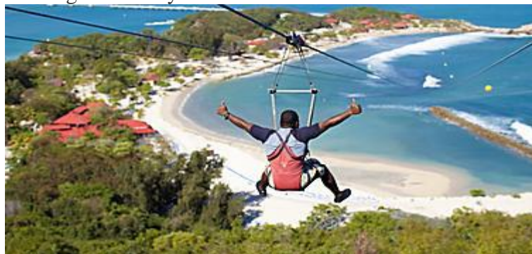
HIGH FLYING THRILLS

CASTILLO DE SAN FELIPE DEL MORRO Strong and beautiful, this fort has helped guard the shore for nearly five centuries while overlooking some of the island's best scenery. Explore it via spiral staircases between levels, and grab a photo at one of the iconic garita sentry boxes that line the outer walls.