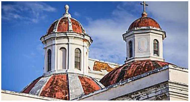
CATEDRAL DE SAN JUAN BAUTISTA Founded in 1521, this can't-miss landmark is one of the oldest churches in the Americas. It houses the tomb of Spanish explorer Ponce de Leon and the mummified remains of religious martyr St. Pio.