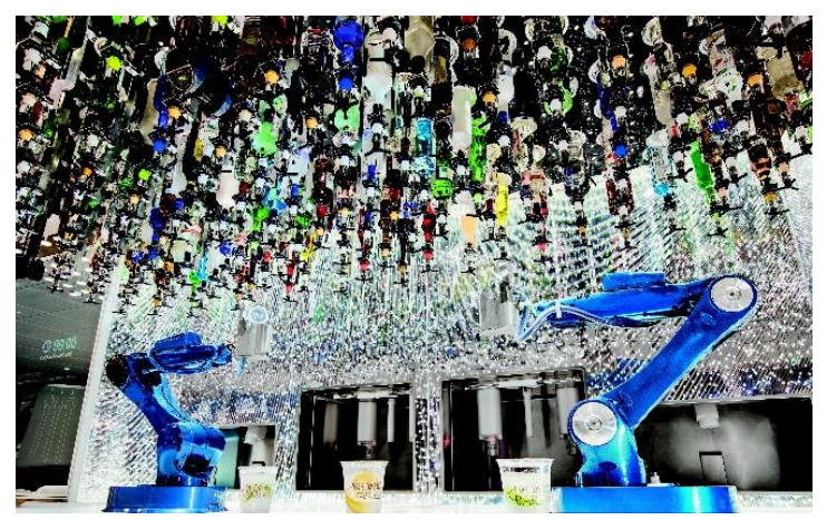
Bionic Bar Closeup