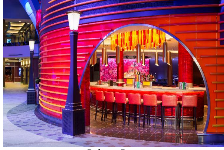
Boleros Bar ESCAPE THE RUBICON